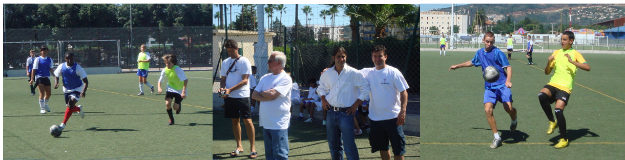
Famous French National Team Coach Michel Hidalgo (center) watches EduKick France players in action in 2007!

Address Chemin des Campalières, 06250 MOUGINS - Tel : + 33 4 92 18 64 10 / Fax : + 33 4 92 18 64 11 www.ac-nice.fr/campelieres